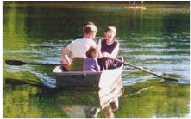
Boat with little flare

What flare does is provide what is known as reserve buoyancy, which is a fancy term for stability in rough seas. That's why many dories have lots of flare, so rough, choppy seas will bounce them around a lot but rarely swamp them. Boats with a lot of flare also tend to get more stable as you increase their load. If you've ever heard someone say you have to load down a dory to get it to "sit down on its lines" they're talking about a boat with a lot of flare that tends to become more and more stable as it displaces (sinks into the water) more.