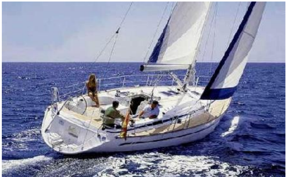
Note how the waterline of this sailboat is canoe shaped in spite of the transom stern.

As a displacement hull moves through the water, it creates a wave both at the bow, where the water is being