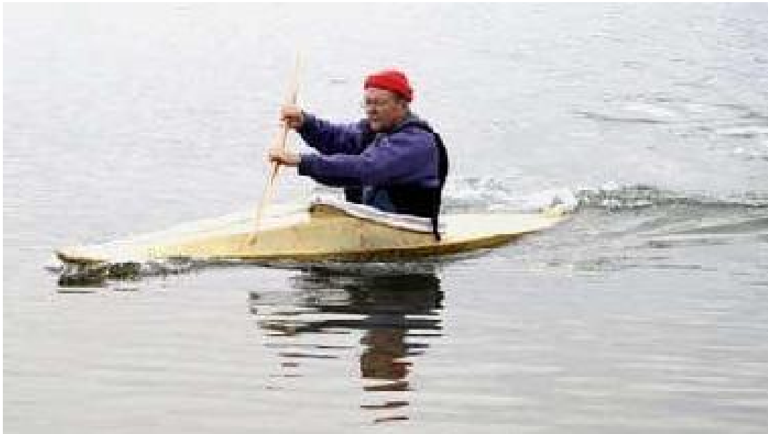
Note how both the bow and the stern create waves as this displacement hull moves through the water.

of water. Trying to push a displacement hull faster than its hull speed becomes very inefficient power wise. If, for example, a 10 hp outboard pushes a certain boat to it's hull speed of 6 knots, putting on a 20 horse motor (doubling the power) may only get it up to 7 knots.