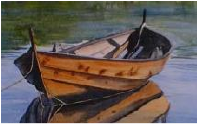
Boat with lots of flare