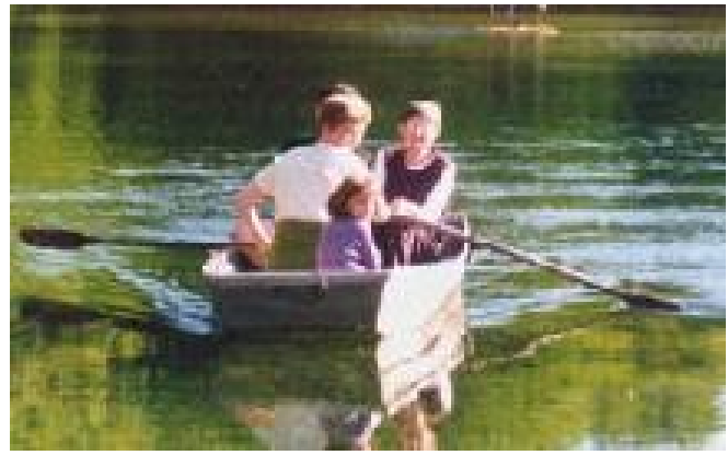
Boat with little flare

What flare does is provide what is known as reserve buoyancy, which is a fancy term for stability in rough seas. That's why many dories have lots of flare, so rough, choppy seas will bounce them around a lot but rarely swamp them. Boats with a lot of flare also tend to get more stable as you increase their load. If you've ever heard someone say you have to load down a dory to get it to "sit down on its lines" they're talking about a boat with a lot of flare that tends to become more and more stable as it displaces (sinks into the water) more.