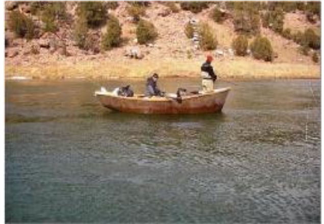
Some Mid-Western Style Driftboats you can build